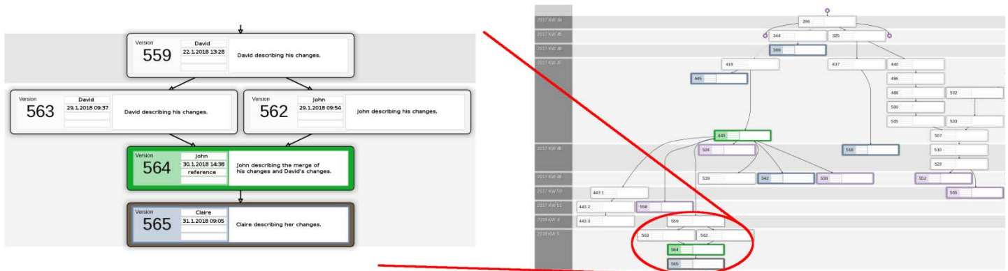
Figure 4: Section of a History Graph in LoCo.

Recently an alternative version control mechanism designated “live mode” was introduced in LoCo driven by Porsche. Engineers may temporarily switch to live mode in order to collaboratively work on the same copy of data for a certain period of time [5]. The live mode feature is mainly used in situations where the normal version control mechanism seems inappropriate. An example for such a situation is the “model set up phase”, where engineers work together closely and would create a lot of unnecessary versions using the standard version control approach.